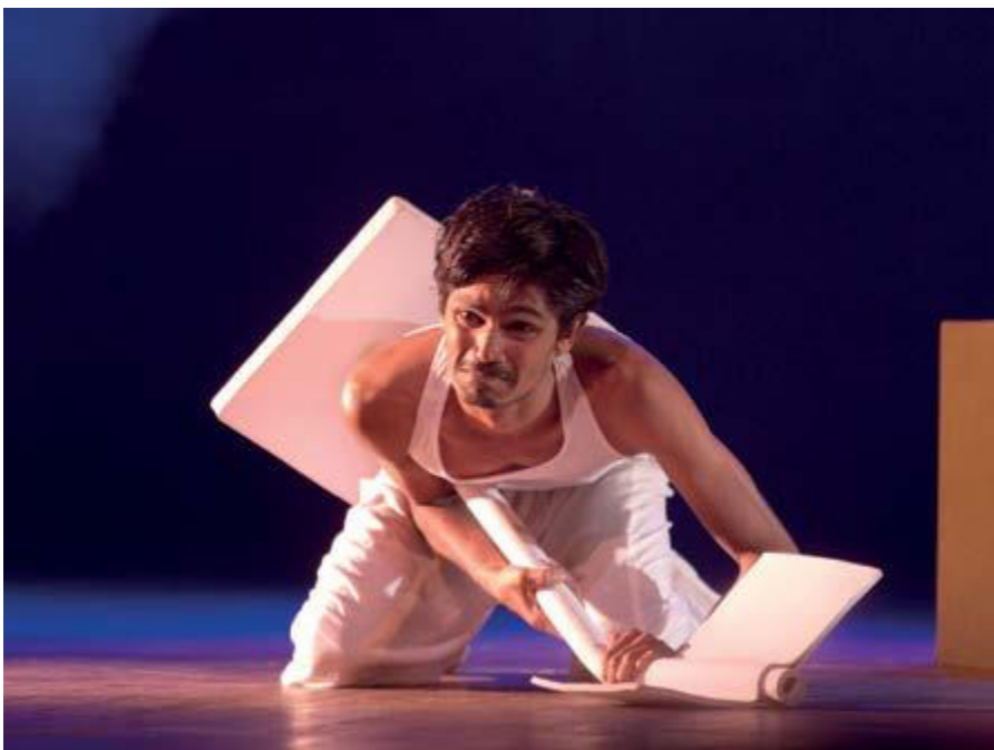
Walking Path , a play without words, produced by Sri Lanka's Stages Theatre Group and written by Ruwanthie de Chickera. The play examines the widespread urban beautification drive in Colombo.

Consider Lia Rodrigues' description of the founding of the Centro de Artes da Maré in the Maré slums of Rio de Janeiro, Brazil, the first cultural centre in the area. The Maré is an area of around 132,000 inhabitants, effectively controlled by three different drug-dealing factions. In common with many of Rio's slums, the area is rarely found on maps of the city, and is practically unknown to most Rio dwellers, as a result of a deliberate tactic by the city which consigns areas