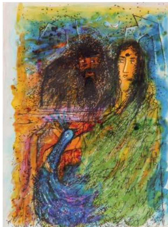
Savindra Sawarkar's picture of a Devadasi woman.

As a community-based peace funder that supports grassroots Dalit activism for equality and justice, the Dalit Foundation has come to recognize that arts and culture are integral to positive social change and the struggle for equality and justice – first