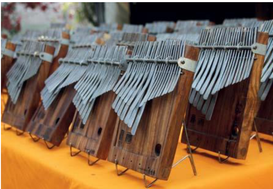
Supported by Culture Fund of Zimbabwe, Mbira in Schools is an initiative to introduce young children to a 900-year-old traditional Zimbabwean instrument.

She instances their support to New York's Lincoln Center to create new public spaces and wider access to their live events; to Fondation Resonance in Switzerland, which offers classical piano concerts in hospitals and old age homes; to the Courtauld Institute and the Prince's Foundation for the Arts in the UK, which connect young people in low-income neighbourhoods to the creative arts and art history.