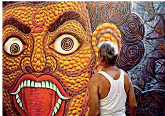
India Foundation for the Arts supported Mayabazar , a film on Surabhi, a 120-year-old travelling theatre company from Andhra Pradesh.